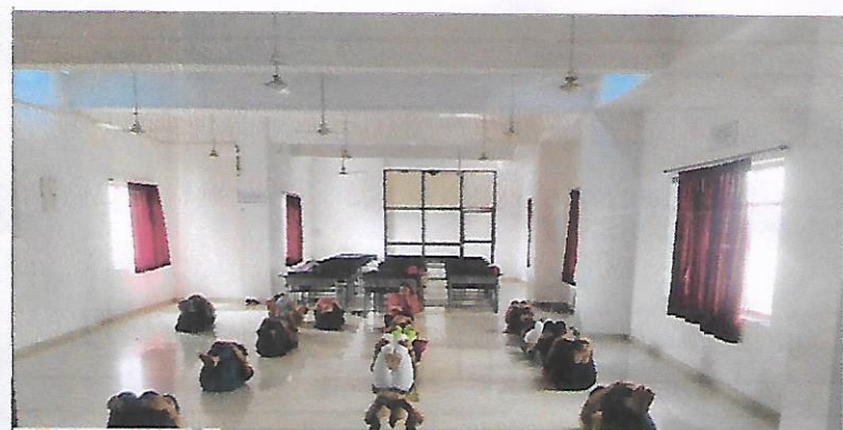
410206, MGM Campus, Kamothe, Panvel, Navi Mumbai, Maharashtra 410206, India Navi Mumbai Maharashtra India 32°C 90°F 2022-05-16(Mon) 04:16(PM)