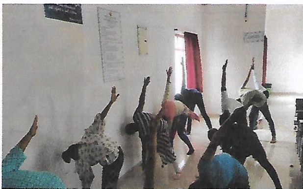
410206, MGM Campus, Kamothe, Panvel, Navi Mumbai, Maharashtra 410206, India Navi Mumbai Maharashtra India 32°C 90°F 2022-05-18(Wed) 04:21(PM)