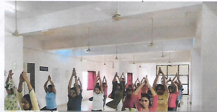
410206, MGM Campus, Kamothe, Panvel, Navi Mumbai, Maharashtra 410206, India Navi Mumbai Maharashtra India 32°C 90°F 2022-05-16(Mon) 04:16(PM)