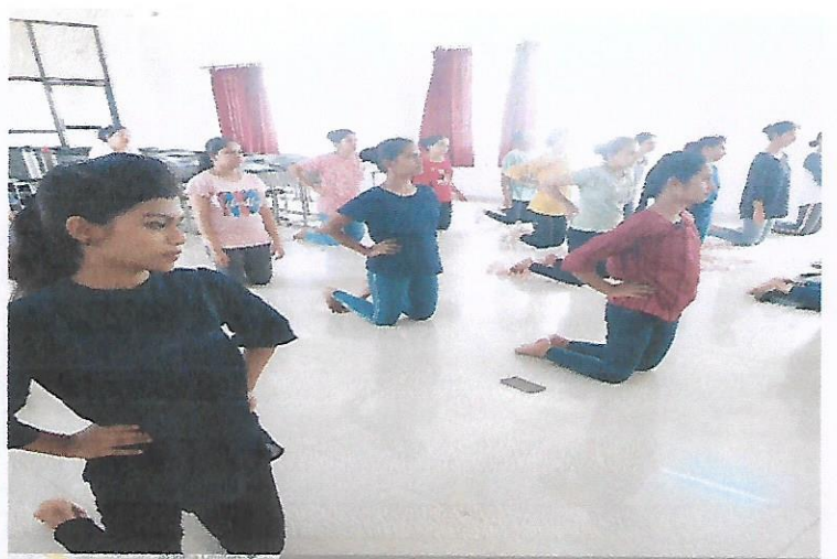
410206, MGM Campus, Kamothe, Panvel, Navi Mumbai, Maharashtra 410206, India Navi Mumbai Maharashtra India 31°C 88°F 2022-05-13(Fri) 09:50(am)