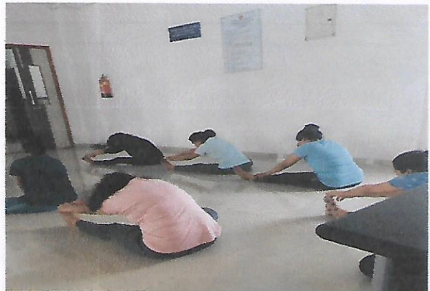
410206, MGM Campus, Kamothe, Panvel, Navi Mumbai, Maharashtra 410206, India Navi Mumbai Maharashtra India 31°C 88°F 2022-05-13(Fri) 09:44(am)